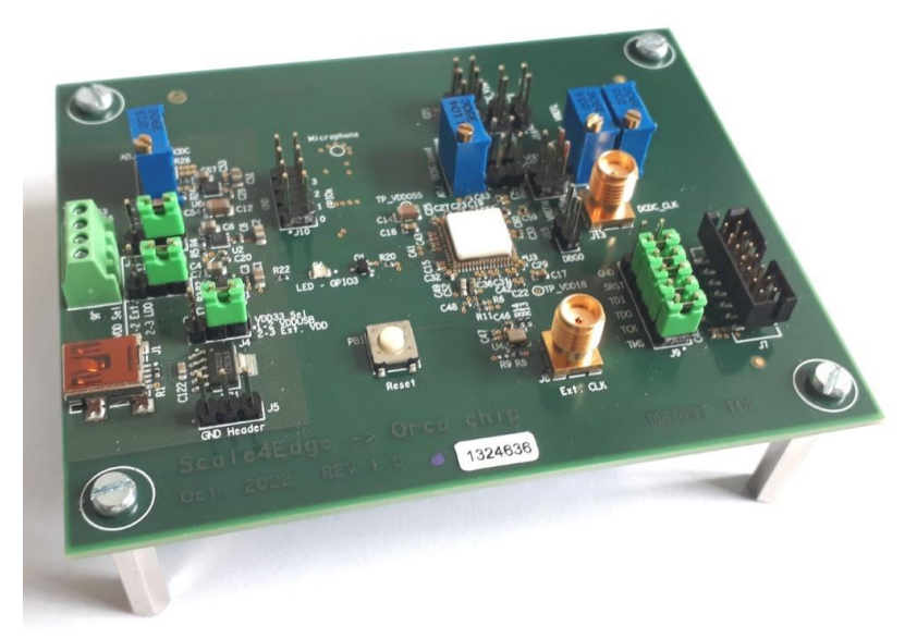
Figure 2: Demo board for keyword spotting with the test chip by TU Dresden (white, center)

The mission of SpiNNcloud Systems is to design energy-efficient AI systems by leveraging practical inspiration from the brain. Its core product is a holistic computing solution ranging from chip design, software development to deployment of full data center servers. Despite our large-scale supercomputers being built leveraging Arm IP, our constant commitment to pursue innovation in an Edge2cloud continuum has led us to evaluate different solutions at different scales. SpiNNcloud is highly interested in commercializ-